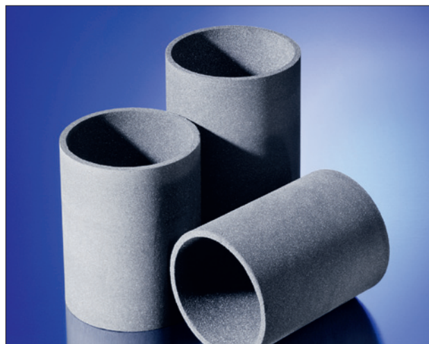
Fig. 12 Metal matrix composites for weight reduction and material reinforcement

separation of both electrodes and their ion solutions by a porous wall, the diaphragm. Thanks to its excellent chemical resistance, the 80% alumina is able to stand up to even aggressive chromic-sulfuric acid in chrome plating. Sulfuric acid is used in electroplating, so plant operators need a resistant ceramic that must also be able to allow chromium ions to pass. Metallic impurities can be prevented with the aid of a permeable medium such as this (Fig. 10).