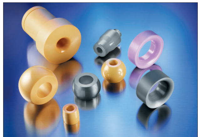
Fig. 5 Forming tools for bending, widening, drawing and rolling