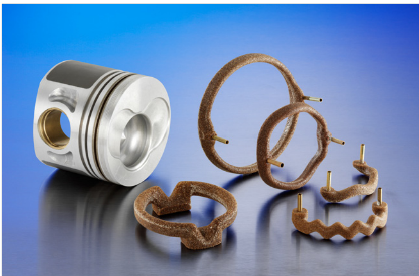
Fig. 9 Cores for manufacturing complex media channels in foundry technology

Porous advanced ceramics are also suitable for use in galvanic applications. CeramTec offers porous galvanic diaphragm cells and plates for the diaphragm process in galvanic baths – in chrome plating for instance. This is a process chiefly used in electrolysis and redox reactions (in galvanic elements) and is based on the