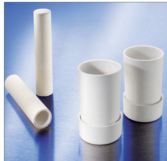
Fig. 10 Porous ceramic components for galvanics