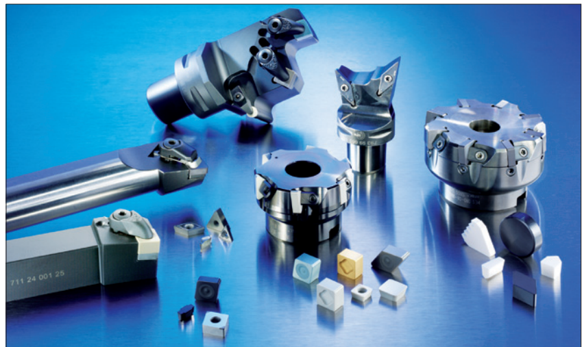
Fig. 2 Range of cutting tools for turning and milling

Cutting materials, inserts and tooling systems for high-performance hard turning applications complete the portfolio. The cutting materials for hard turning feature