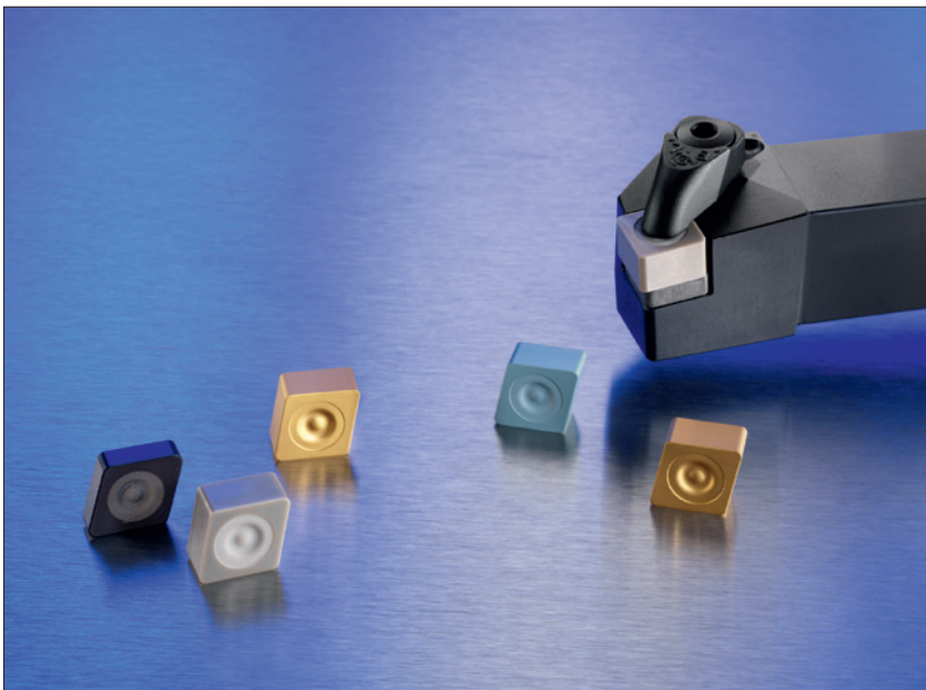
Fig. 1 Tool holder and cutting inserts for turning, made from different ceramic grades

Tools in metalworking must meet a variety of requirements. They must be particularly robust and wear-resistant even under the harshest conditions in order to be used in machining processes. Advanced ceramics from CeramTec not only meet the required standards, they are also economical thanks to their long service life.