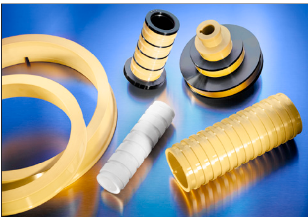
Fig. 4 Tools for wire drawing

of the tools used, e.g. forming rolls and drawing cones, must be perfectly adapted to the wire's requirements in order to ensure that the surface of the wire does not suffer any permanent damage. Over the years CeramTec has continued to develop