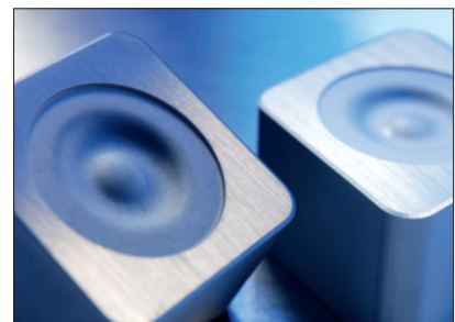
Fig. 3 Cutting inserts made from SiAlON

Machines and wires are subject to extremely powerful forces whenever copper and aluminum wire is drawn. The surfaces