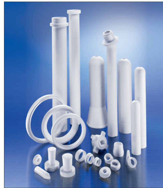
Fig. 8 Aluminium titanate components for aluminium casting

Manufacturers across the globe also use advanced materials from CeramTec for the manufacturing of media channels and cavities in the casting process. Water-soluble, salt-based cores are used to produce complex casting components in foundry technology, e.g. for piston casting. Applications range from gravity and low-pressure die casting to high-pressure die casting. The cores are used as placeholders for the cavities in the casting and offer numerous advantages compared to conventional sand cores. They are very resistant and dimensionally stable, create very smooth casting surfaces and, thanks to their water solubility, can be completely washed out from the mold without leaving any residue. This helps prevent casting failures due to core gases. The core application properties make it possible to increase part quality through an optimized casting process. There are no harmful emissions during casting and core removal. In addition to classic pressing processes to produce water-soluble, salt-based cores in the shape of a ring, core shooting is applied to realize complex geometries and sophisticated designs. CeramTec also offers a large number of different ceramic materials for cores used in fine casting to produce complex components made of various metal alloys (Fig. 9).