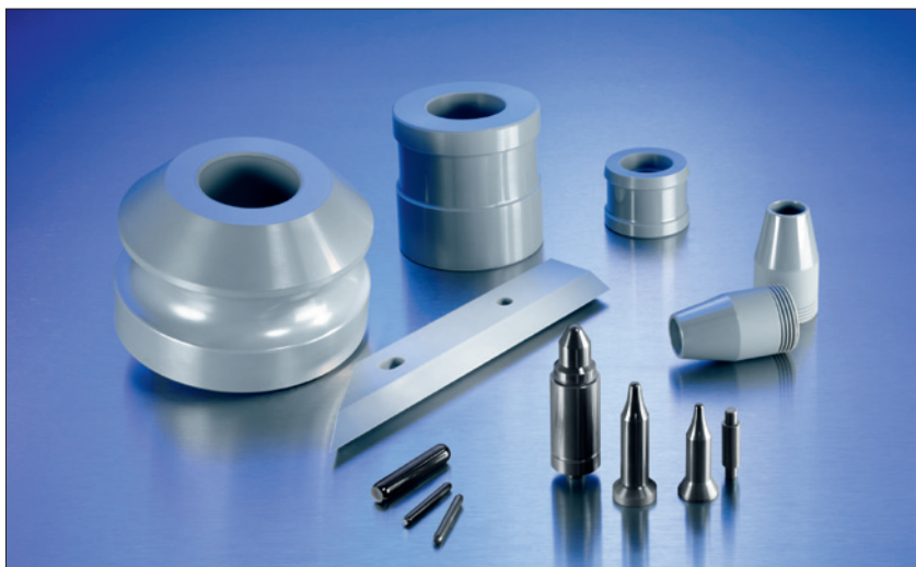
Fig. 6 Components for welding process, e.g. welding pins, welding rollers and gas nozzles