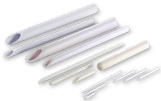
CeramTec manufactures tubes with different diameters and a standard maximum length of 2200 mm (greater upon request).

Mostly drawn in use to a specific requirement our manufactured protection tubes and insulators are primarily used within the industry of temperature measurement and control technology. CeramTec manufactures ceramic tubes for a wide range of applications. Technical ceramics manufactured by us meet the most stringent specifications and high accuracy standards.