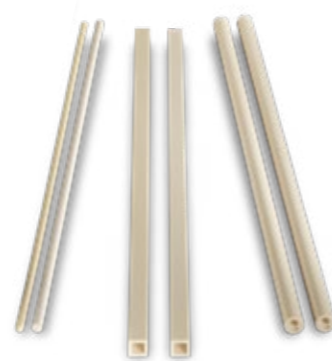
Special tailormade geometries

* Dimensions refer to the rectangular tubes