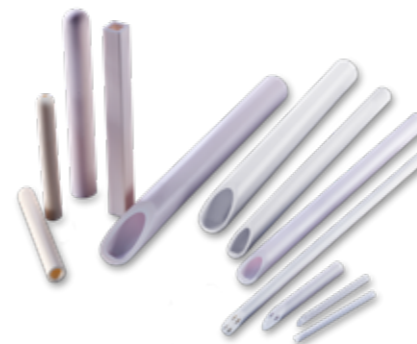
Standard Pyrometric Tubes, Insulating Rods and Tubes

Various forms and shapes of extruded parts are available from CeramTec's product range. Different customer re-quirements demand varied tool designed to their specific applications. Ceramic insulating rods for thermo elements in accordance with EN 50113 standards, available with and without slots.